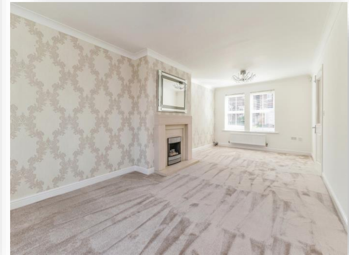
The Hastings, Middlesbrough TS6 0BB