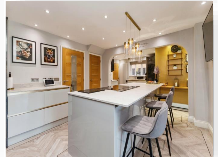
Harvington Chase, Coulby Newham Middlesbrough TS8 0TR