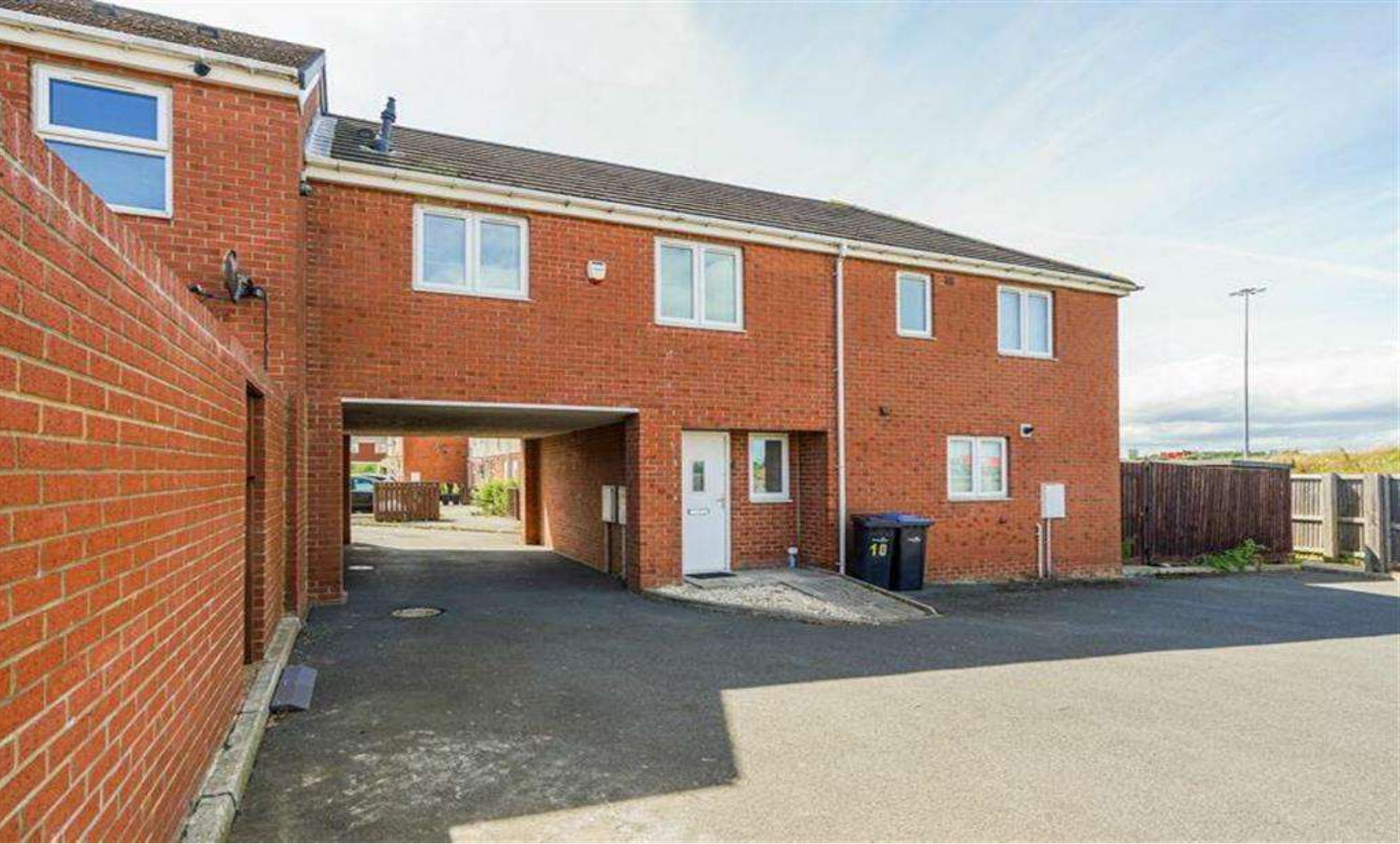
Kildale Court, North Ormesby, Middlesbrough, TS3 6LS