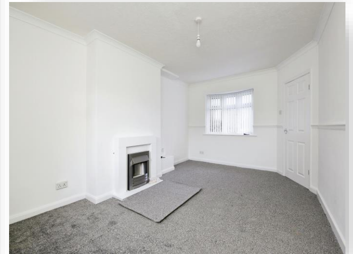
Chatham Gardens, Hartlepool TS24 8HL