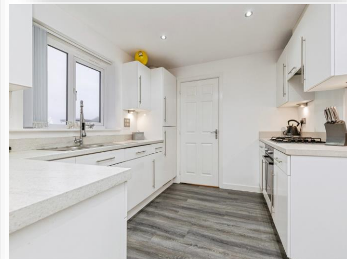
Topaz Close, HARTLEPOOL TS24 0GL