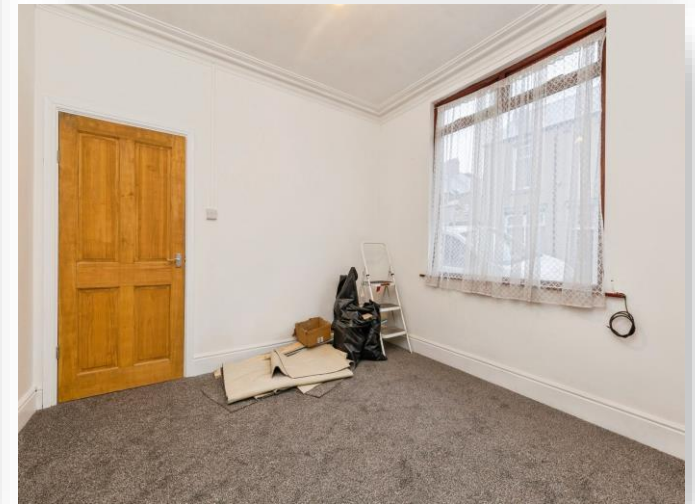
Powell Street, Hartlepool, TS26 9BN