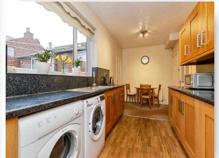
Cornwall Street, Hartlepool, TS25 5RY