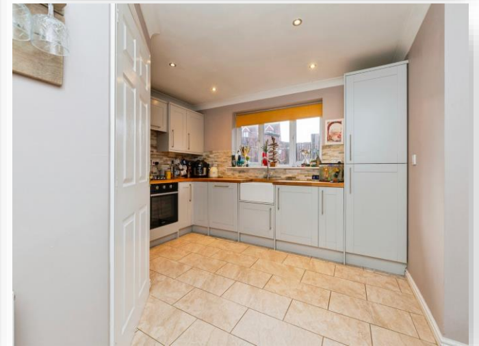
Cornflower Close, Hartlepool TS26 0WJ