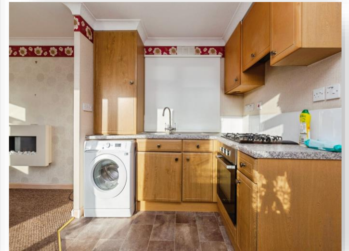
Seaview Park Homes, Easington Road, Hartlepool, TS24 9SJ