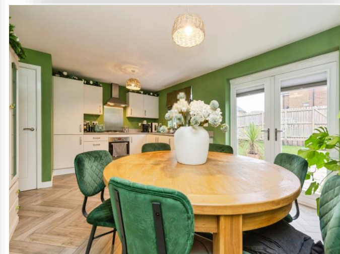
Aspen Gardens, Hartlepool, TS27 3DD