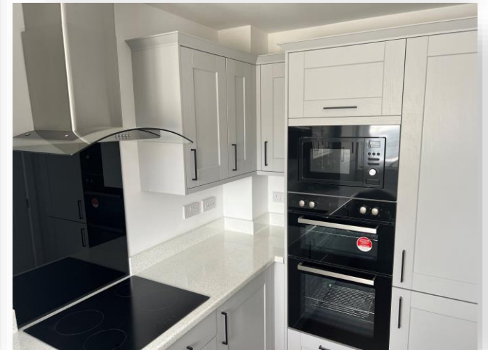
Woodside Meadows, Hartlepool, TS25 1DF