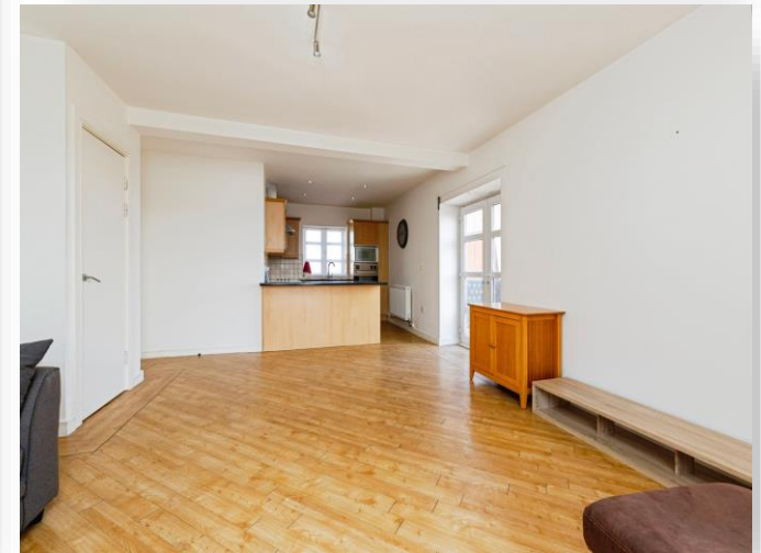
Mariners Point, Hartlepool TS24 0FB