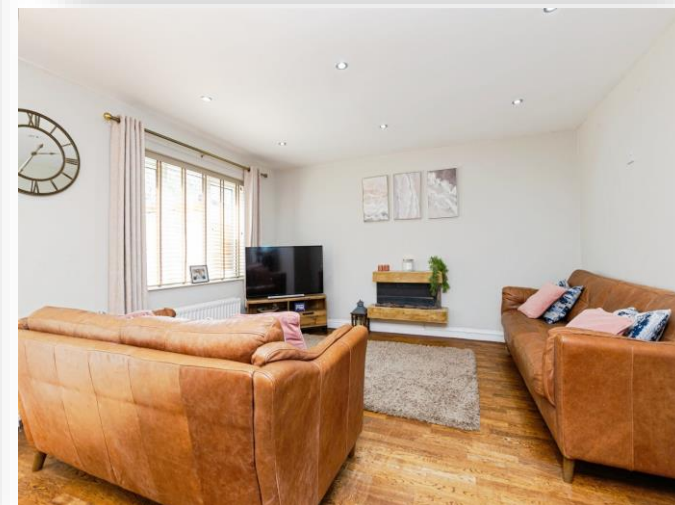
Whin Meadows, Hartlepool TS24 9NT