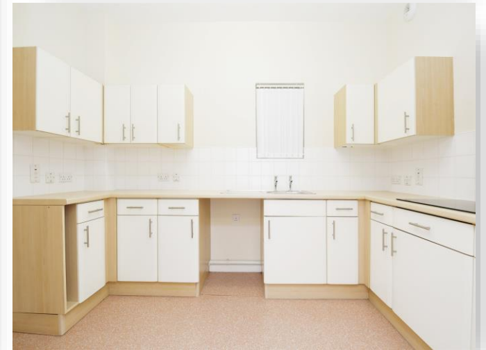
Hartfields Manor Hartfields, Hartlepool TS26 0NW