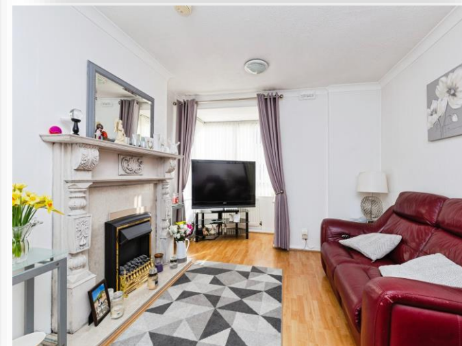
St. Catherines Court, Hartlepool TS24 7HZ