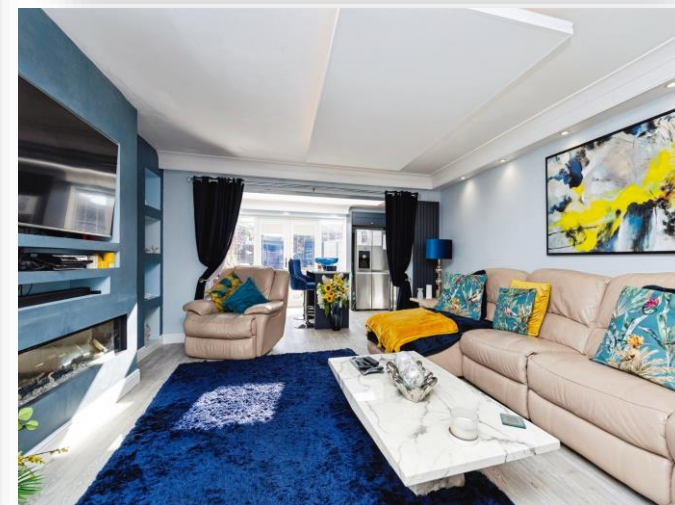
Boston Close, Hartlepool TS25 2QQ