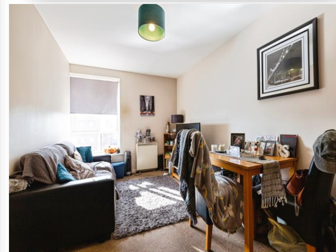
Marina House Harbour Walk, Hartlepool TS24 0UX