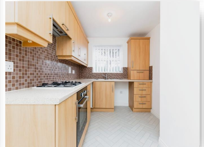
Chester Road, Hartlepool TS24 8FD