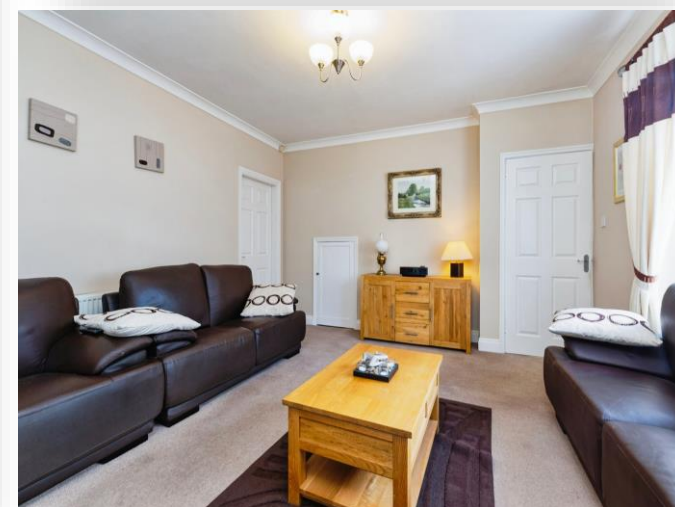
East View Terrace, Hartlepool TS25 1AN