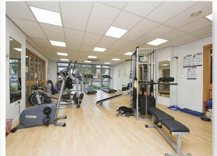
Wethers Nook Hartfields, Hartlepool TS26 0NY