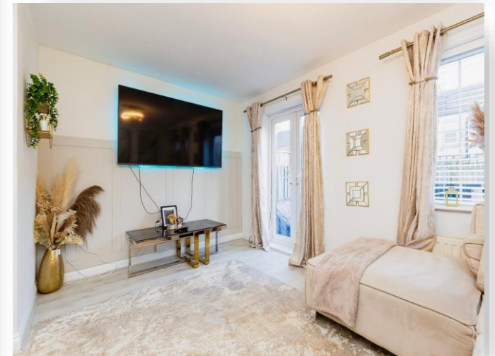
Poole Gardens, Hartlepool TS26 8GG