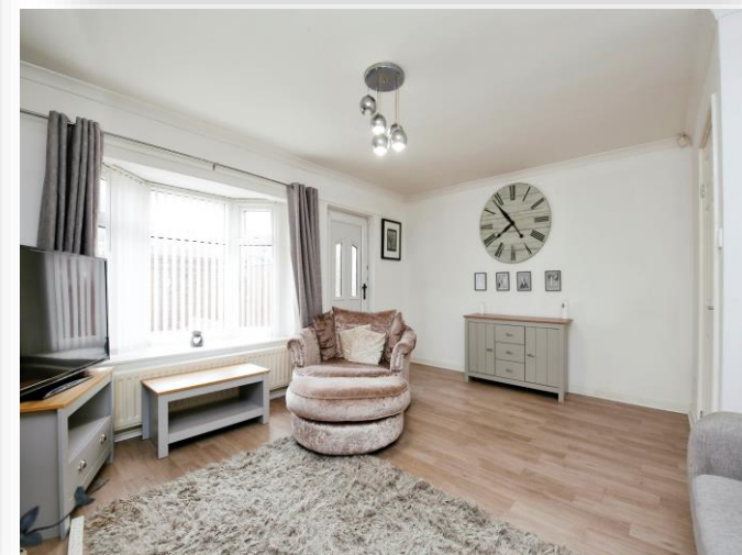
Friendship Lane, Hartlepool TS24 0TS