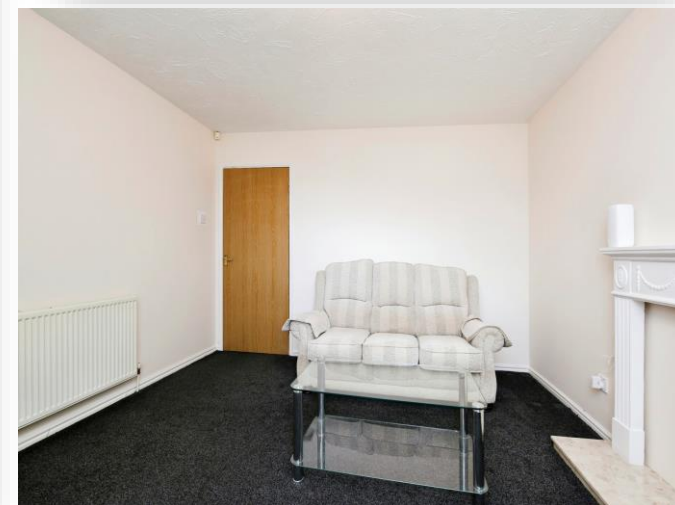
Chandlers Close, Hartlepool TS24 0XL