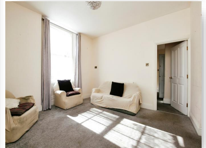
Union Mews, Hartlepool TS24 0JJ