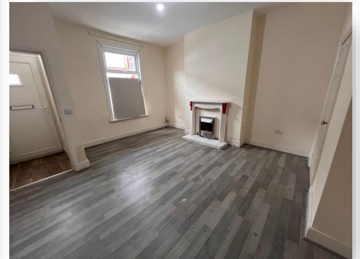
Dent Street, Hartlepool TS26 8AY