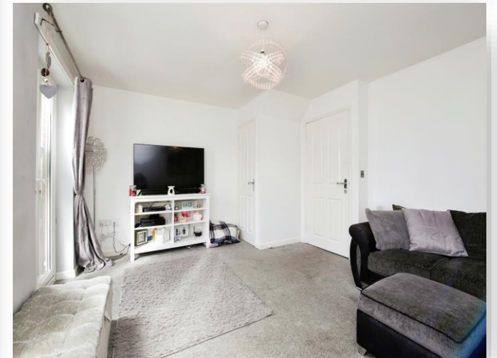
Stockton Road, Hartlepool TS25 2PQ