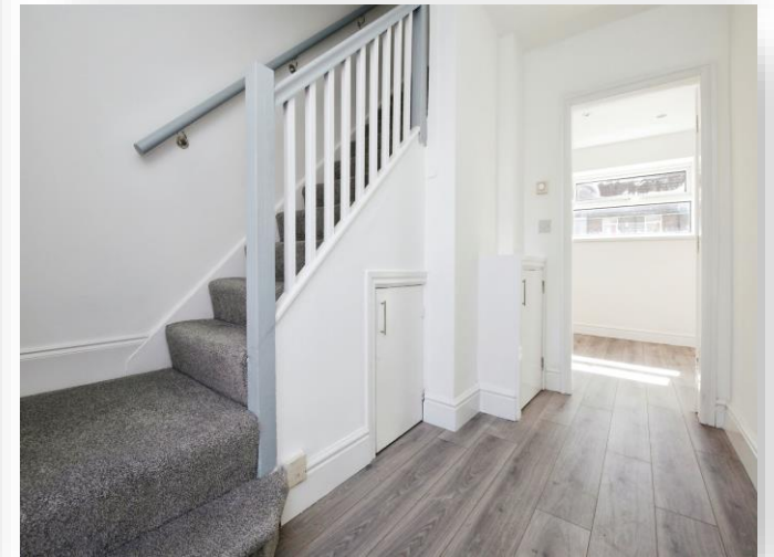
Airdrie Grove, Hartlepool TS25 5EL