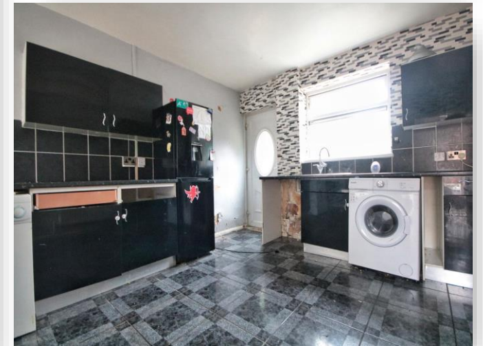
Elgin Road, Hartlepool TS25 4DX