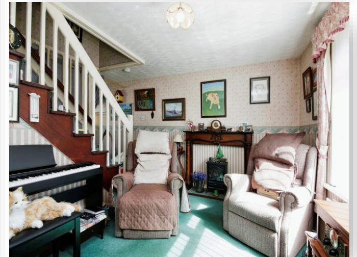
Hilda Walk, Hartlepool TS24 7ND