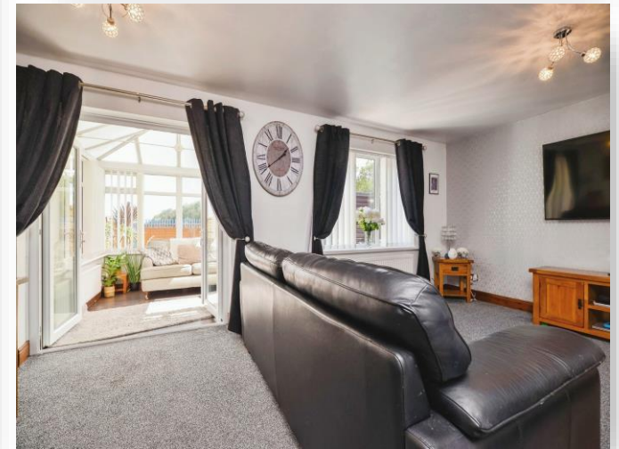
Whin Meadows, Hartlepool TS24 9NX