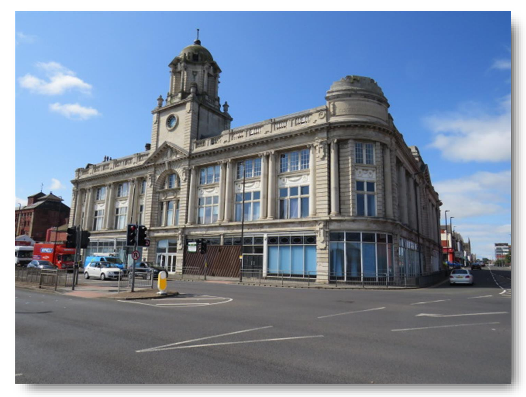
Park Tower Park Road, Hartlepool TS24 7PT