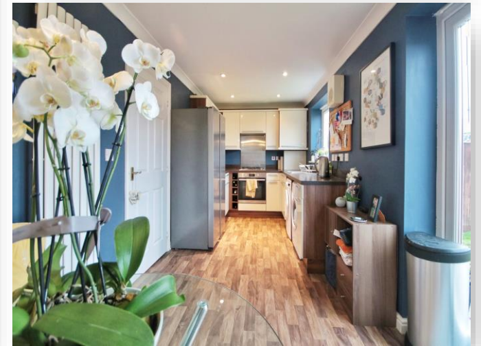
Evergreen Close, Hartlepool TS26 0YZ