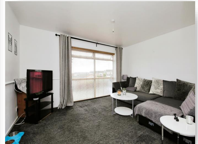
Gleneagles Road, Hartlepool TS27 3PU