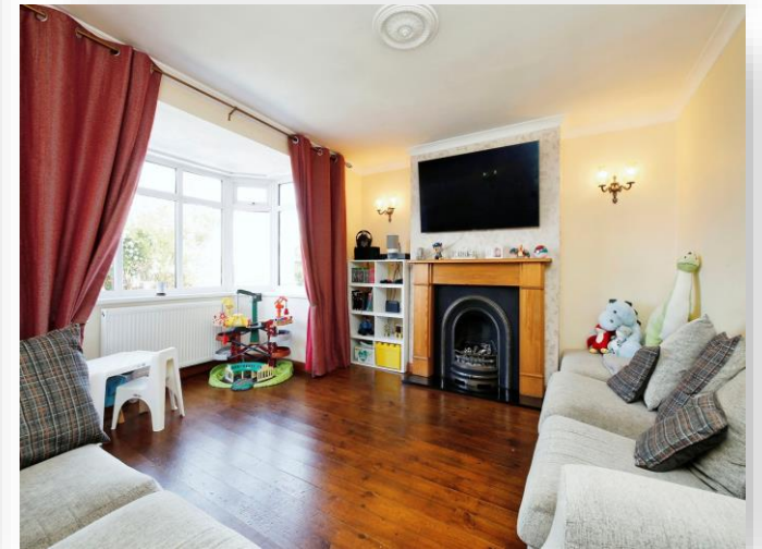
Teesbrooke Avenue, HARTLEPOOL TS25 5JF