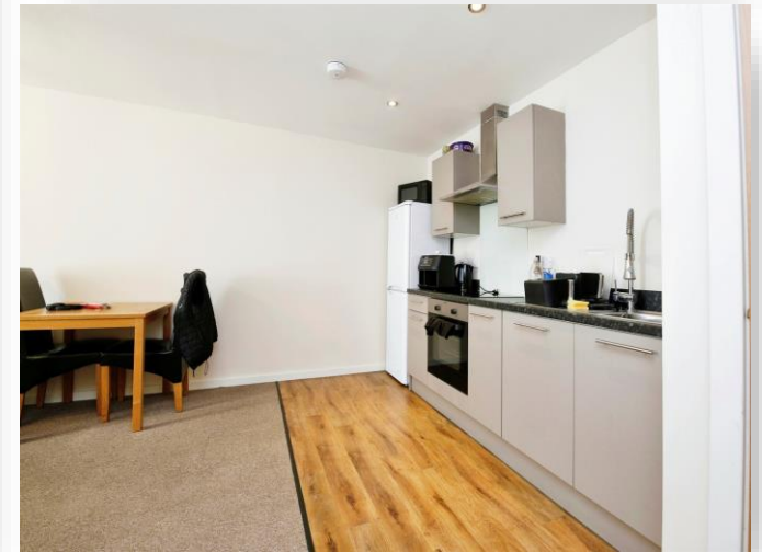
Marina House Harbour Walk, Hartlepool TS24 0UX