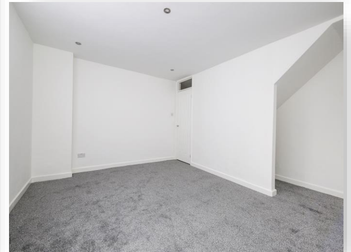
Ivy Grove, Hartlepool TS24 8LG