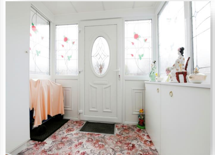
Fenton Road, Hartlepool TS25 2LL