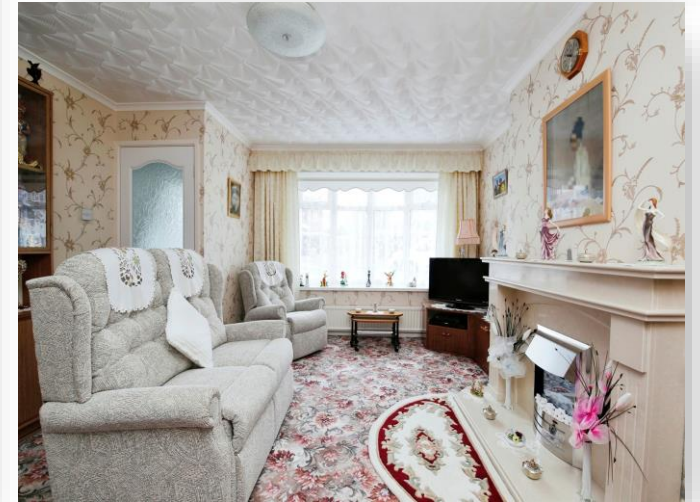
Fenton Road, Hartlepool, TS25 2LL