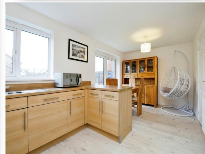
Butterstone Avenue, Hartlepool TS24 0GA