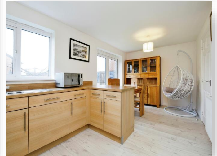
Butterstone Avenue, Hartlepool TS24 0GA