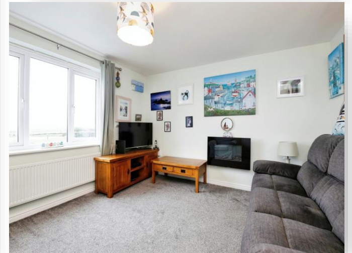
Butterstone Avenue, Hartlepool TS24 0GA