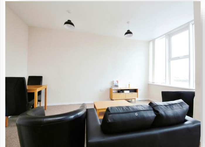
Marina House Harbour Walk, Hartlepool TS24 0UX