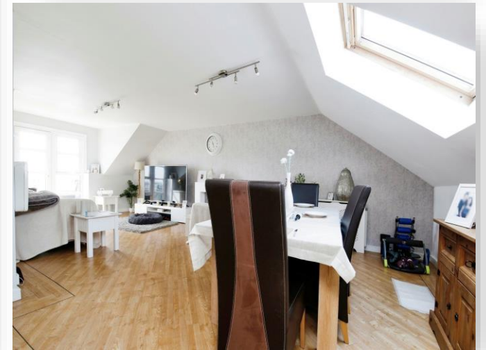
Mariners Point, Hartlepool TS24 0FB