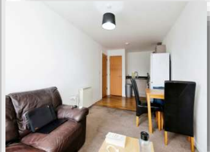
Marina House Harbour Walk, Hartlepool TS24 0UX