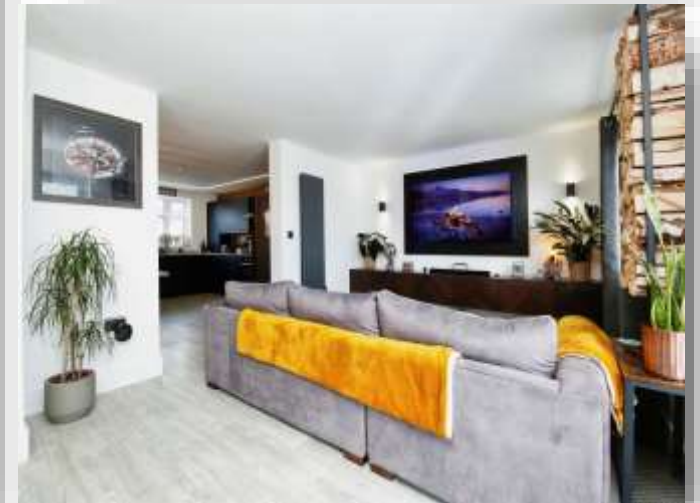
Laurel House The Village Green, Wingate TS28 5GY