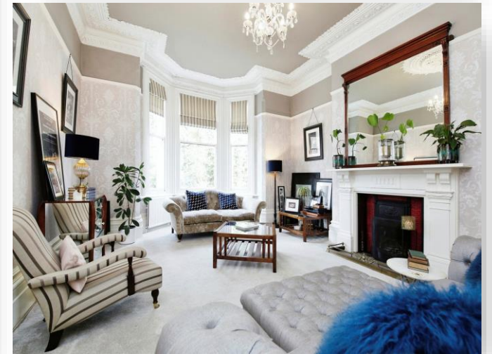
Jesmond Grange Road, The Parade Hartlepool TS26 0DY