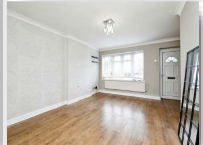
Pannell Place, Hartlepool TS27 3QD