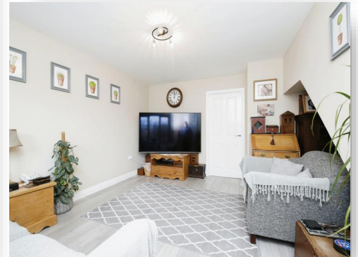
Bedale Close, HARTLEPOOL TS25 1JH