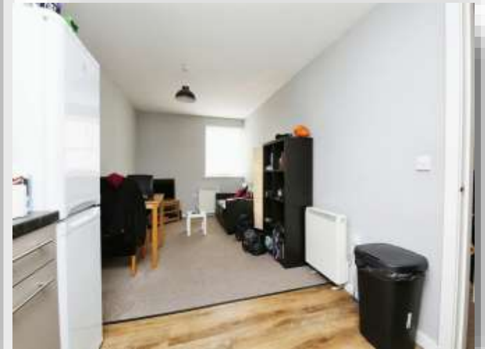
Marina House Harbour Walk, Hartlepool TS24 0UX