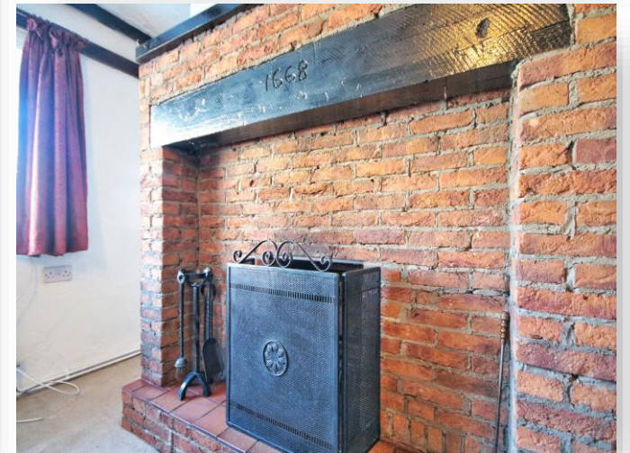
Palace Row, Hart Hartlepool TS27 3AY